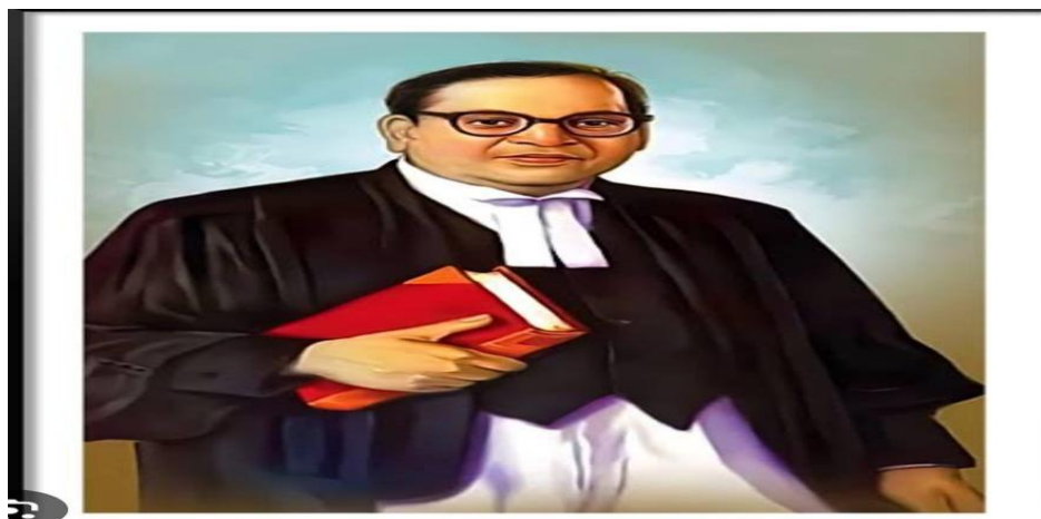
Dr. B. R. Ambedkar